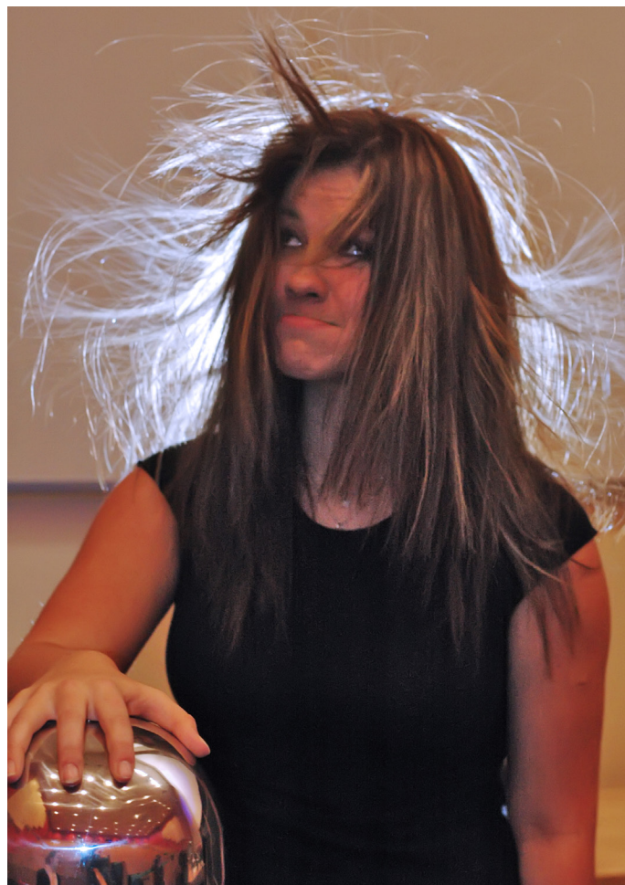
A hair-raising experience with a Van de Graaff generator: illumination from behind helps emphasise the hairdo.

To work out the voltage of the Van de Graaff generator, and thus the voltage on our volunteer, we can use the length of the sparks in combination with the breakdown voltage of air—the voltage required to cause air to dissociate into ions and become conductive. This voltage is about 30,000 V/cm for dry air (hot, humid or lower-pressure air will tend to spark more easily). Sparks from the Van de Graaff are typically a few centimetres long, giving a voltage between 50,000 and 150,000 V.