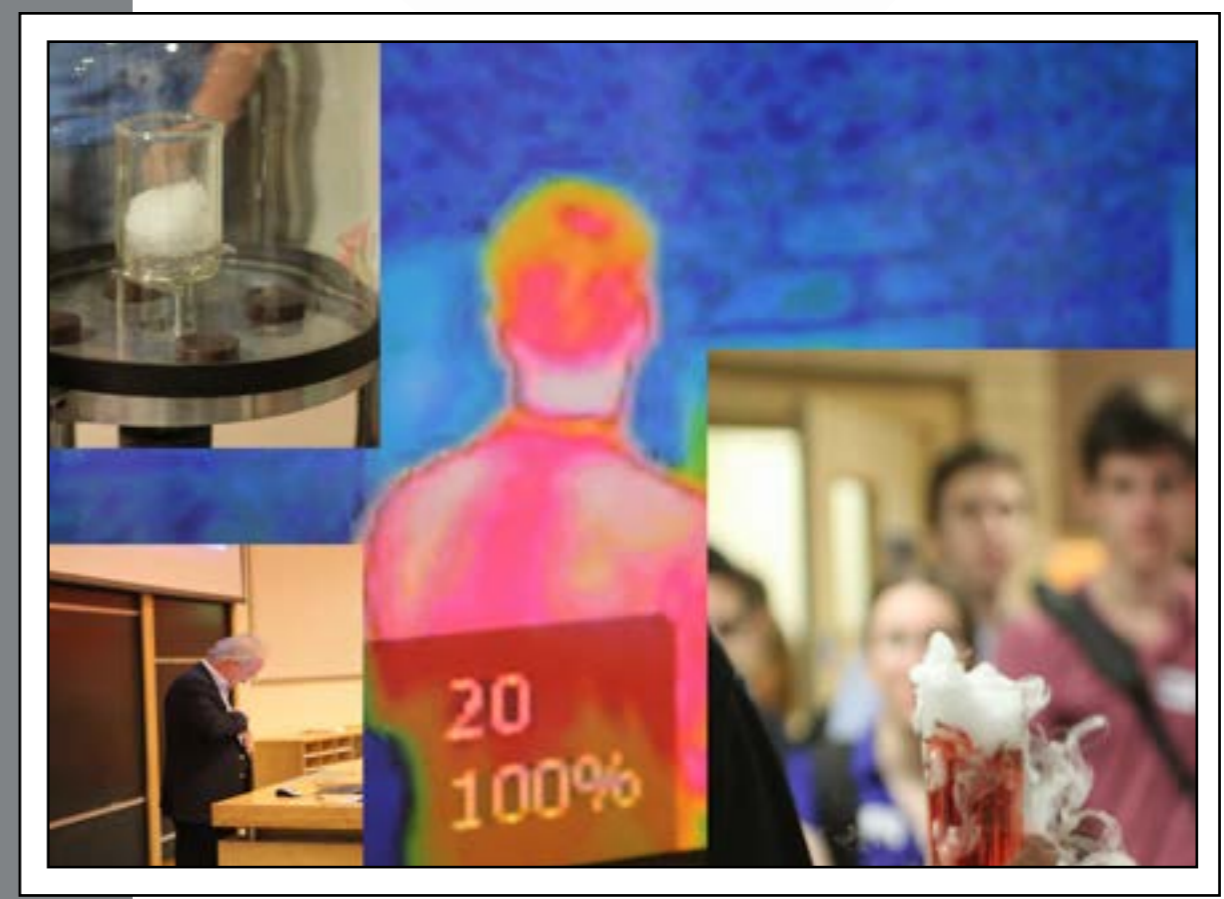
Open Day Images